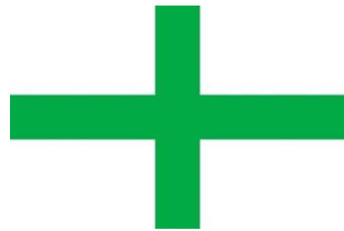
Green Cross Standard

In 1812 a group called "Patriots of Amelia Island" kicked the Spanish out and raised their own flag. The next day they raised the U.S. flag, but Spain demanded the island be returned, so it became Spanish again.