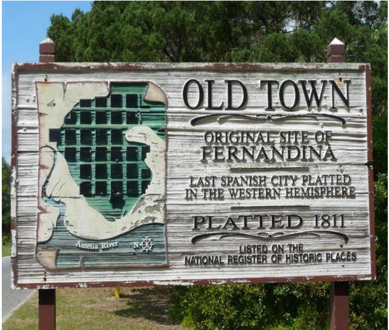
Old Town in Fernandina Beach

By the early 1900's, however, the tourism trade had moved south to St. Augustine, and Fernandina became somewhat isolated. Today it is a bustling little town of about 11,000 souls.