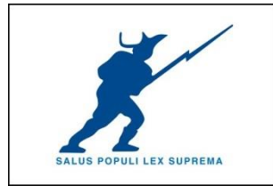
Patriots of Amelia Island

After the Revolutionary War, the victorious Americans took the island from the English and gave it back to Spain.