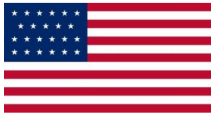
United States of America

During the first year of the civil war, however, the island was under the Confederate flag.