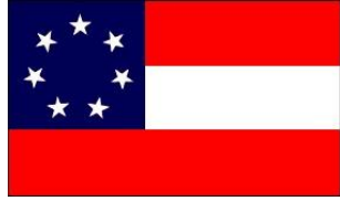
Confederate States of America

Amelia Island finally became United States soil in 1821 when Florida became a territory.