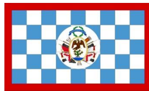
Mexican Rebel Flag

In 1817 an adventurer named Sir Gregor MacGregor captured the Spanish Fort San Carlos, and he raised his own flag, the Green Cross standard.